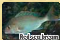
Red sea bream